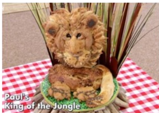
Lion appears in Bake Off !